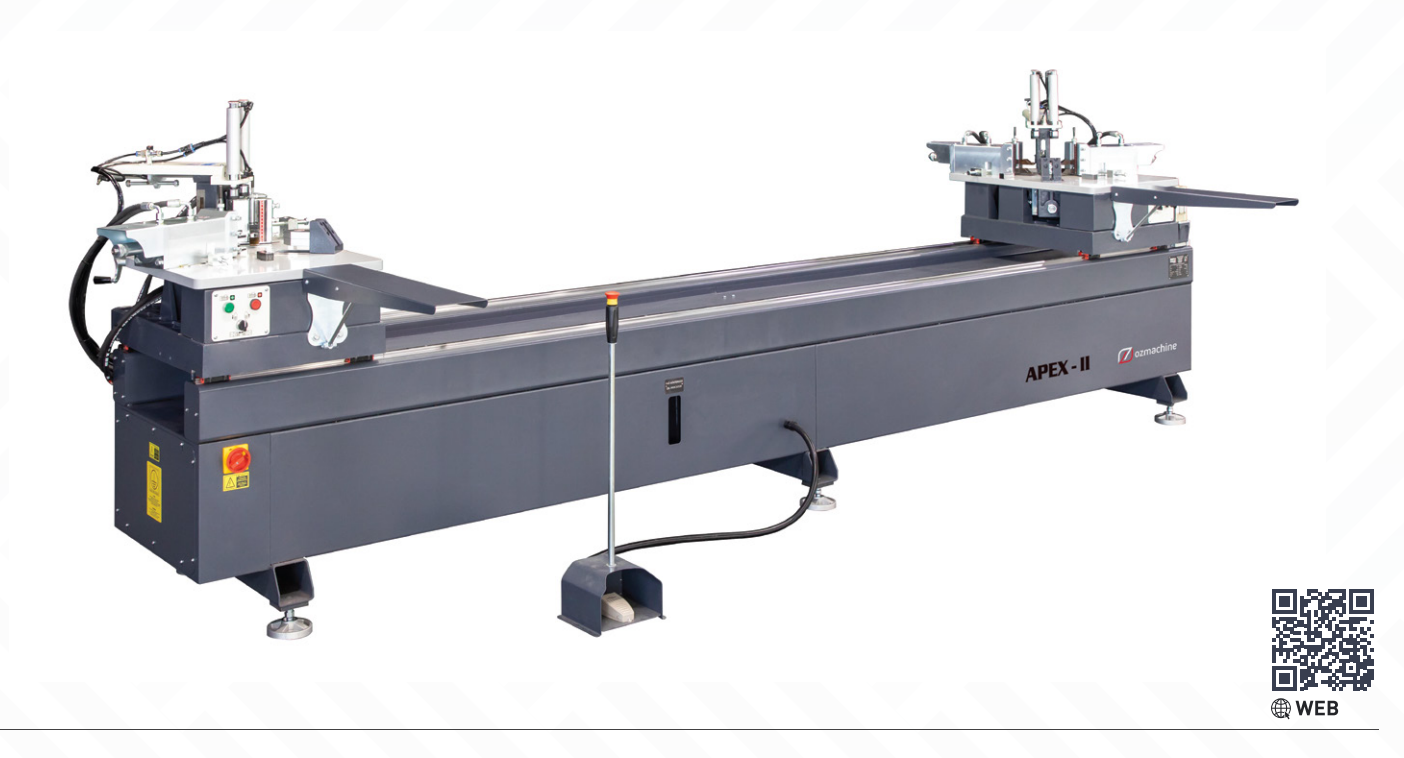
APEX - II, which has automatic hydraulic double head corner crimping, is used for corner binding processes for aluminium profiles. Incorporating manual metering precision and the power of hydraulic system in its body, it provides its users with quick solutions. APEX - II provides a perfect corner binding process while minimising the user errors thanks to its double stage pressure system.